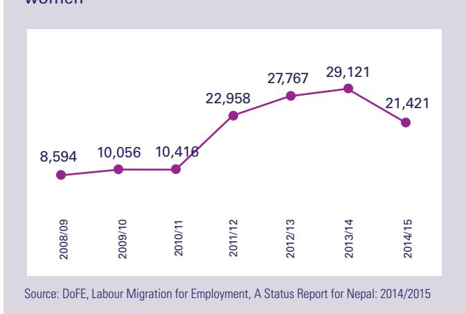
FIGURE 1: Number of labour permits issued to women

The increase in female migration from Nepal may be attributed to the changing global labour market and household structures, which have resulted in differential impacts on women in sending and receiving countries. For instance, in receiving countries, women's entry into the labour force, particularly in East and Southeast Asian countries, and the changing family structures and lifestyle changes in the Gulf countries have created demands for migrant domestic workers. At the same time, in Nepal, growing numbers of women have been entering the labour market migration abroad is an extension of women's search for job opportunities. By 2015, nearly 60% of migrant